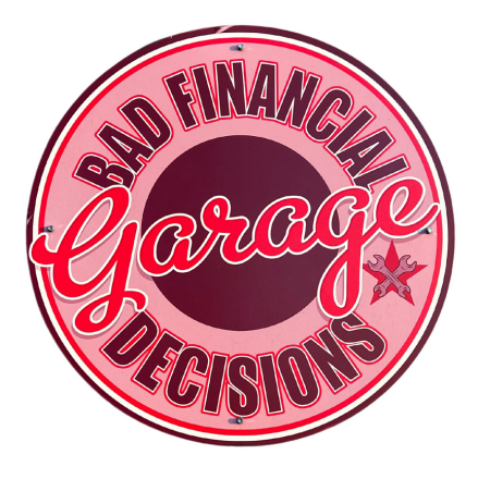
SCOTT & AMY'S MOTORCYCLE COLLECTION